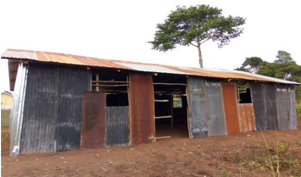
Zion Church Kakuba – temporary home of two nursery classes